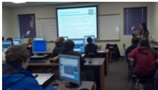
Meeting for senior 21st Century Scholars.

Students were also given the parameters and expectations for 21st Century Scholar assistance for college attendance once they graduate from high school.